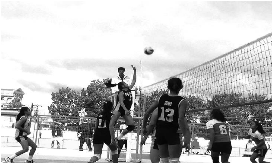
Powerhouse National Capital Region to take a shot at dominance once again in the Final Round of Women's Volleyball Tournament.